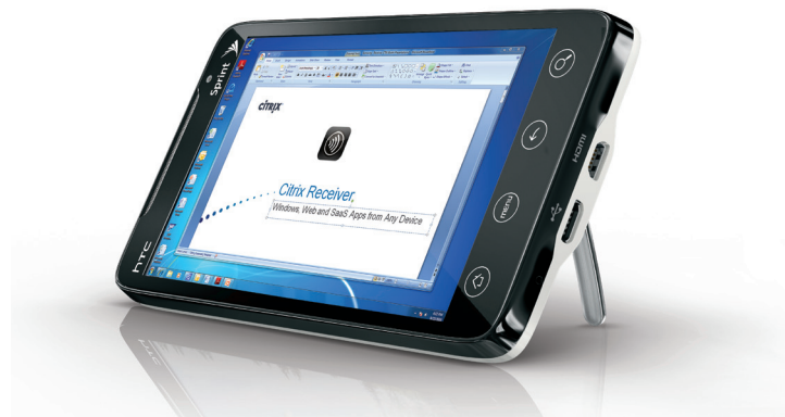
Windows applications with Citrix Receiver on a Sprint Evo smartphone

Receiver is a lightweight software client that runs on all major mobile platforms, including Android, BlackBerry®, Windows® Mobile, Symbian® and iPhone® and makes it simple for professionals to work from anywhere. With Receiver installed, IT has complete control over security, performance and user experience while providing end users with fast and familiar access to all their enterprise Windows applications and virtual desktops.